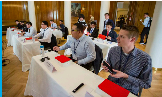
steelChallenge-13, Madrid, April 2019

Annual highlights include steelManagement (a four-day course on steel business strategy) and steelChallenge (a global competition for young people using a manufacturing simulation).